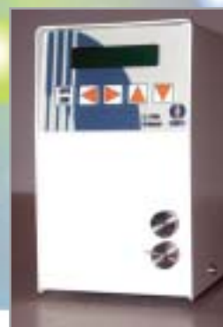
LC1245K Refractive Index Detector