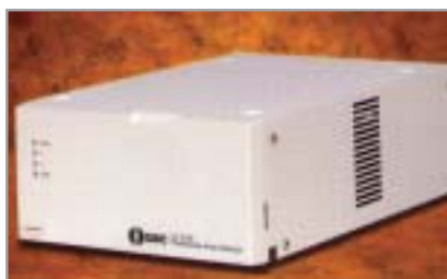
LC5100 Photo-Diode Array detector

This very compact PDA provides the latest validation tools to support GLP/GMP. The LC5100 delivers a superb noise level of \pm 0.8 \times 10^{-5} AU for unsurpassed sensitivity, bringing new levels of accuracy to trace component identification, spectral elucidation and library searching. Full scan spectra can be continuously collected in the flowing analyte stream