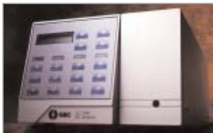
LC1260 Electrochemical Detector