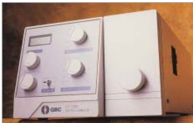
LC1200 Variable Wavelength UV-Vis Detector

GBC offers a comprehensive range of quality high performance HPLC detectors from turn-key systems to stand alone modules including autosamplers, pumps and detectors. GBC also offers accessories such as columns, fittings and tool kits.