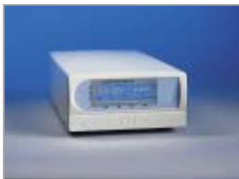
LC1275 Conductivity Detector

1 nA to 1000 nA FS (Integrator Output) (4 steps in decade sequence).