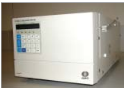
LC1255s Fluorescence Detector